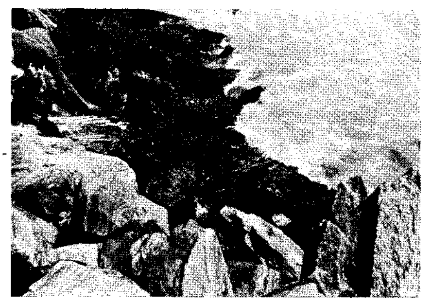
The Seaweed growth on rocks along Cannanore coast

Out of the total density of 1000 tonnes important, agrophytes formed 27 tonnes followed by alginophytes and agaroidophytes. The abundance of seaweeds in this coast appears to be low compared to other seaweed areas of the